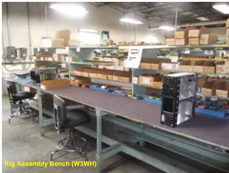
Rig Assembly Bench (W3WH)