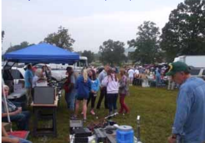
Saturday's Hamfest Flea Market (W8BVH)

Ten Tec had tents set up with multiple operating positions, so that attendees could operate their equipment, including the new Argonaut VI. Word is that 25 prototypes of the Argonaut VI are being sent to beta-testers within the next few days, and the radio should be going on sale very soon.