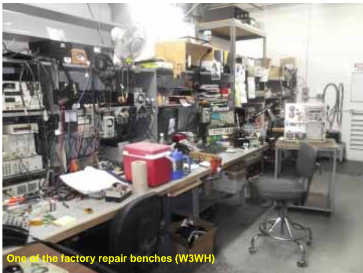
One of the factory repair benches (W3WH)