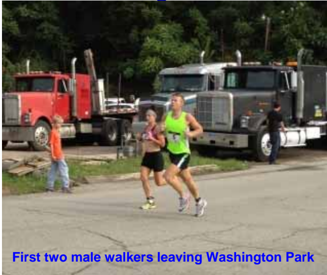
First two male walkers leaving Washington Park