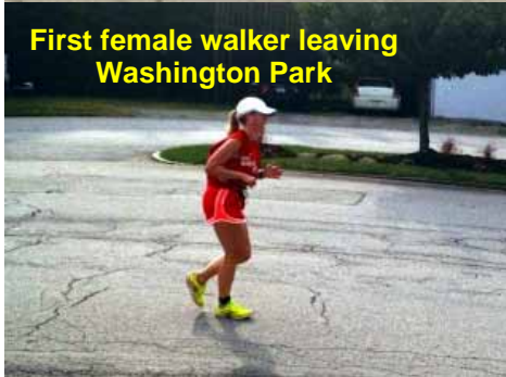
First female walker leaving Washington Park