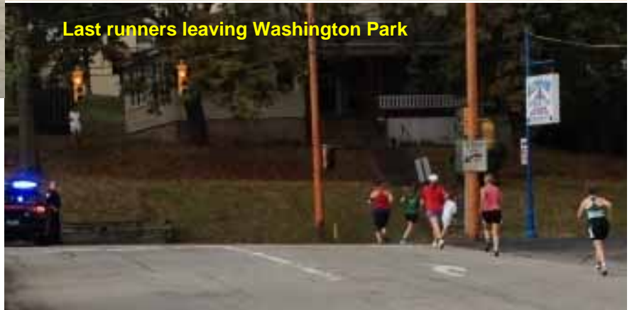
Last runners leaving Washington Park