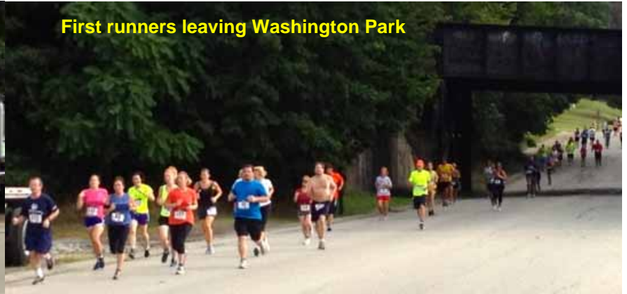
First runners leaving Washington Park