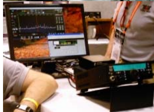
Above: A few pictures from 2011 Dayton Hamvention: (top) The ARRL QSL wall, (middle) the original W6AM Station, (bottom) the Ten Tec Eagle.