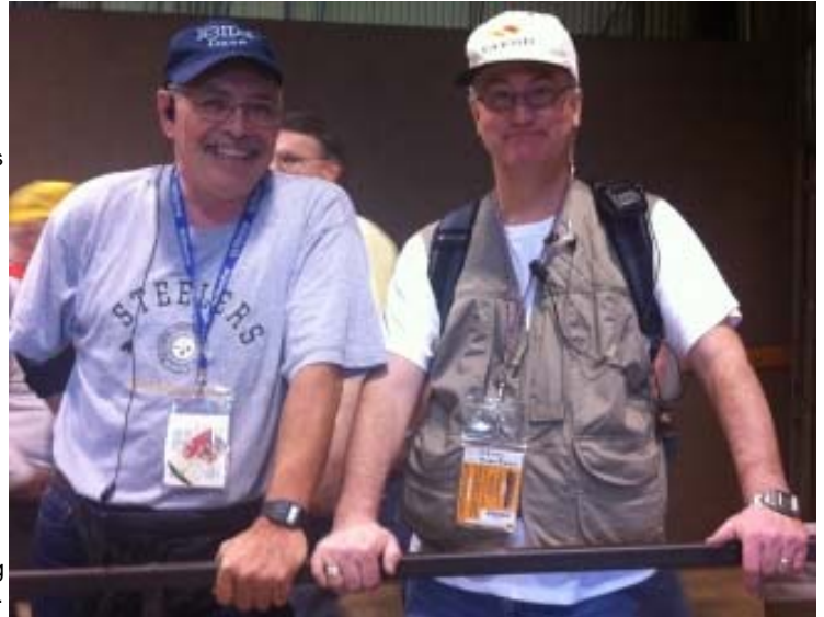
"Suspicious looking characters I saw at Dayton!" Spotted at the HARA Arena during the course of the weekend...