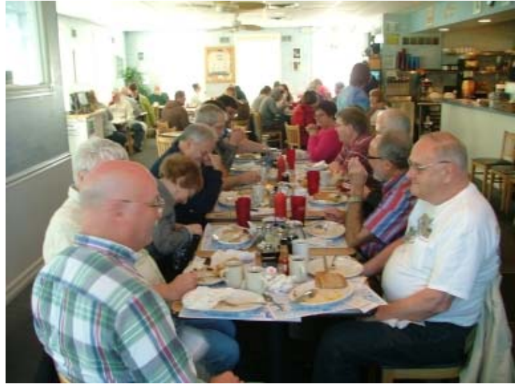
The April gathering of The WASH Breakfast Gang at the Beach House in Finleyville. Below left, even after we leave, we hang around chatting!