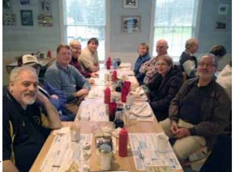
The WASH Breakfast Gang at the Beach House, New Years Eve morning.

Every month we're going to feature a WASH club member, something about them, something they're involved in or a club-related activity that we're involved in, in the WASH Spotlight . Submissions for the Spotlight should be sent to Ron W3WN at newsletter at n3sh dot org