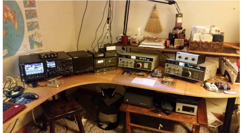
W3WH Shack as of late March 2016

What was the point of telling you all these things? Well it's merely to point out that even after 60 years in the hobby there are lots of things that can maintain and maybe even increase your interest. I look forward to trying to work the few remaining countries that are still on the DXCC list. I've reached 330 and I believe there are currently 339 countries on the list so there are still opportunities for me not to mention I only have 81 countries on 160 m so I have loads of room for future successes there. This is a great hobby. Make sure you take full advantage of it.