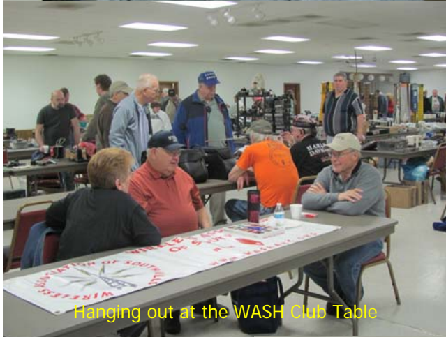
Hanging out at the WASH Club Table