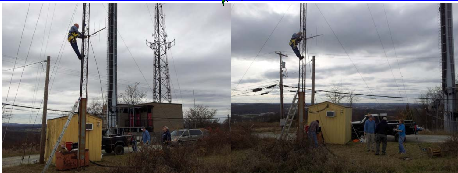
A few more views of the work being done on N3FB/R on November 16th.