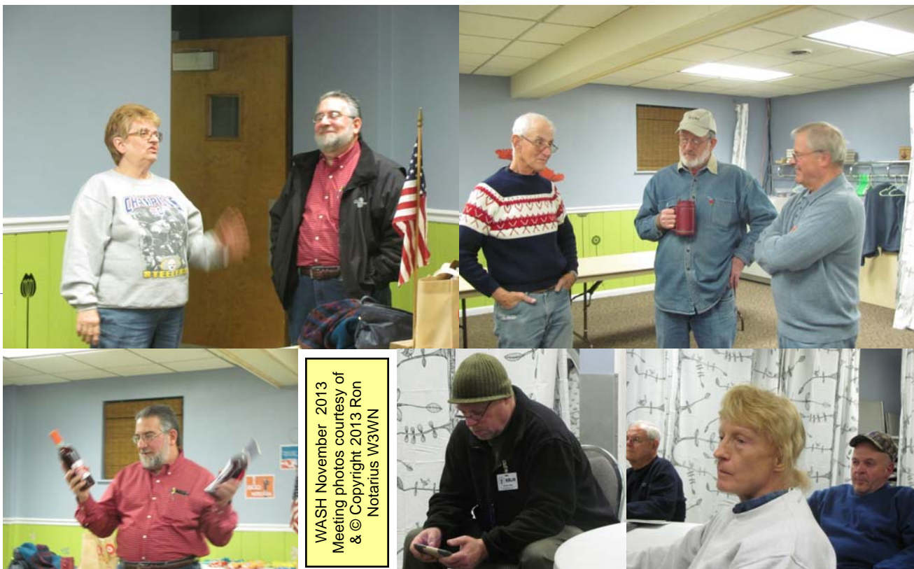
WASH November 2013 Meeting photos

Most Amateurs active through the late 1980's will not so fondly remember when Radio Moscow seemed to dominate the SW 41 meter band most nights, rendering the upper 2/3 of 40 meters almost useless for domestic & international Amateur SSB communications