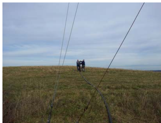
N3FB/R November 16 th .

Bottom line: Enjoy the contest, but do so responsibly.