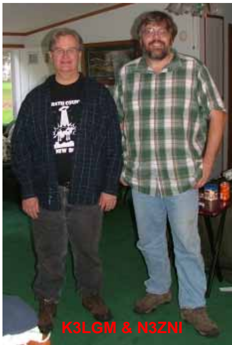
K3LGM & N3ZNI