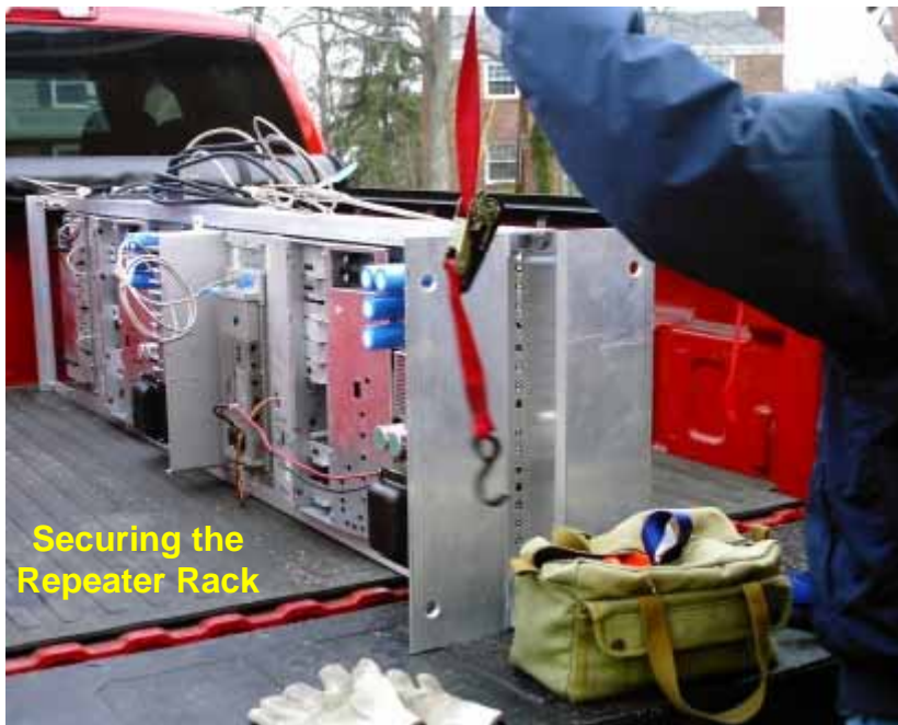
Securing the Repeater Rack