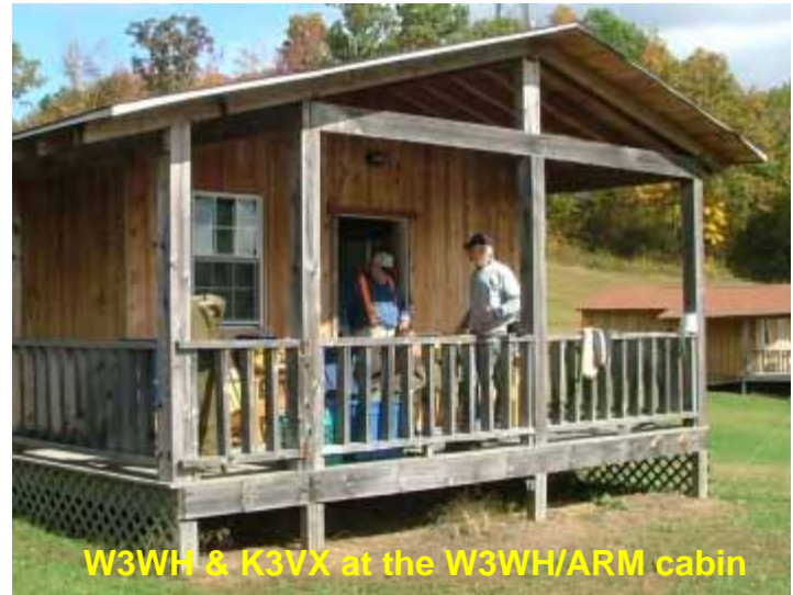
W3WH & K3VX at the W3WH/ARM cabin