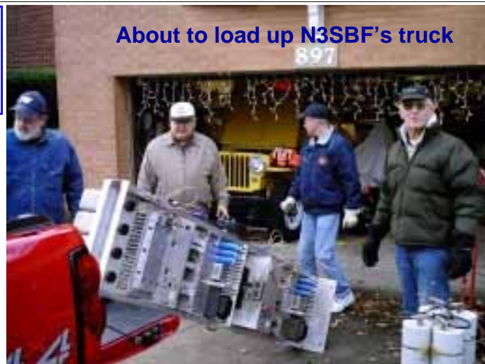
About to load up N3SBF's truck