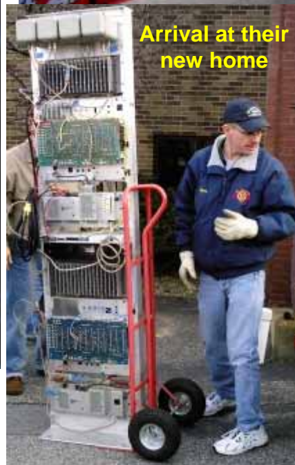
Arrival at their new home