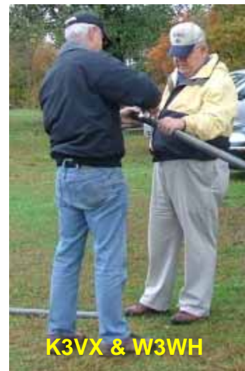
Antennas @ W3WH/Armstrong