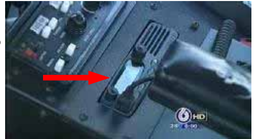
WRTV Photo of Indianapolis Police vehicle showing "second radio," which appears to be a Kenwood TM-271 or equivalent radio

— courtesy of WRTV-6 Indianapolis http://www.theindychannel.com/news/18778493/detail.html#