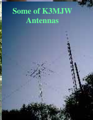
Some of K3MJW Antennas