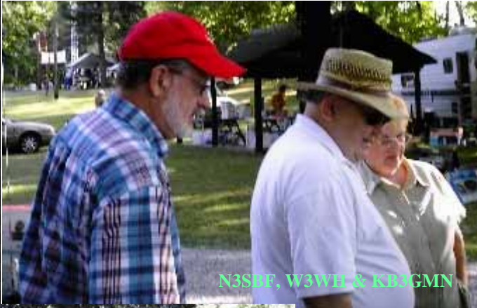
N3SEF, W3WIF & KB3GMN

Many WASH Members were in attendance at this year's Skyview Radio Society Hamfest & WPA Section Convention.