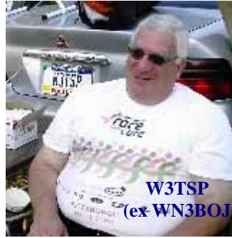
W3TSP (ex WN3BOJ)