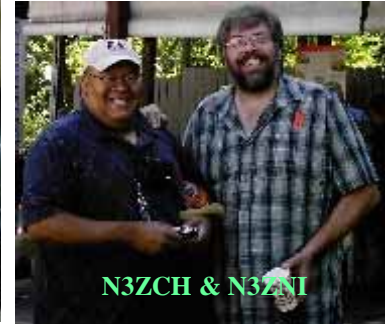
N3ZCH & N3ZNI