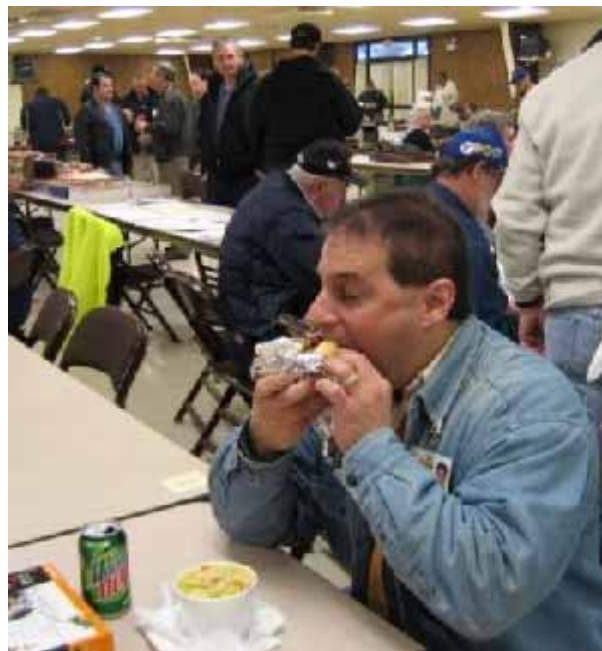
doing what he does best!