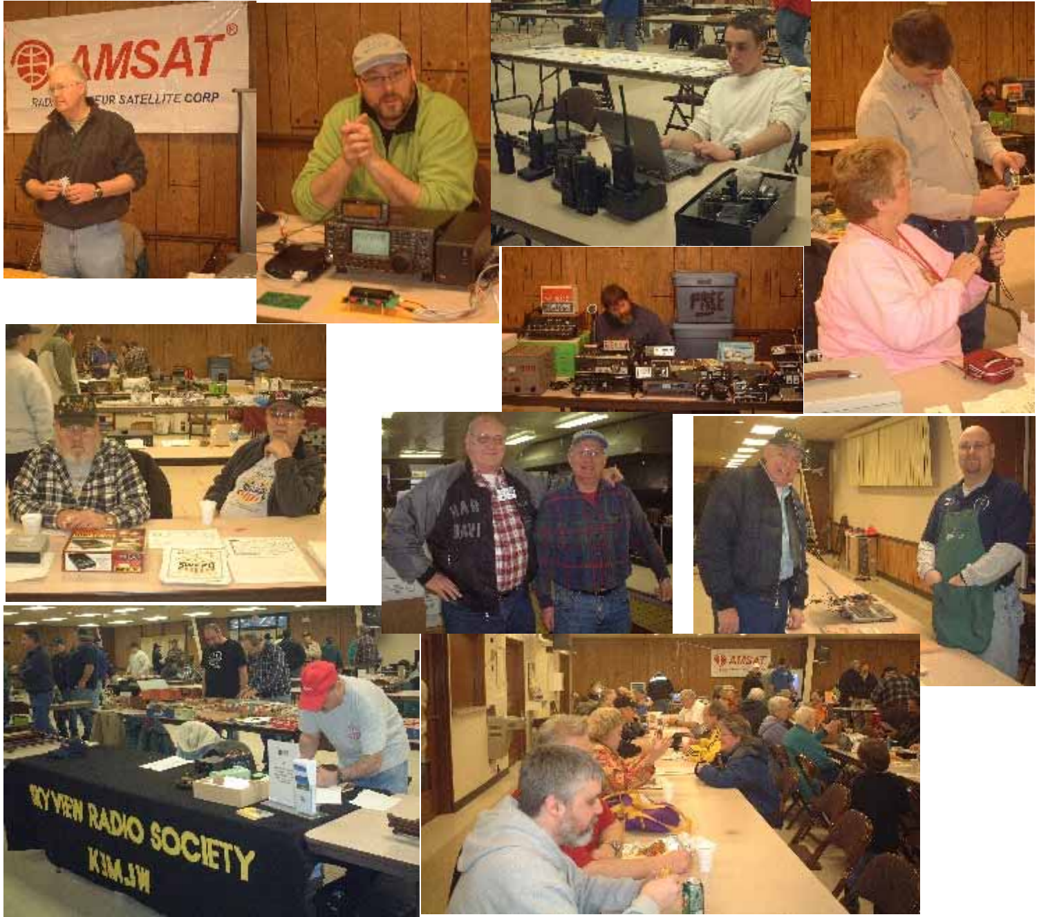
(Meeting Minutes Continued from Page 4)