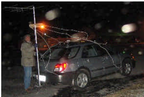
The Yagi in windy weather.

The Yagi becomes a major pain as we move from place to place. Finally, I leave it up guyed to the roof rack. Overall, it wasn't worth taking along.