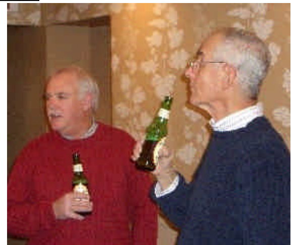
Some "Pre-Dinner" shots of club members, our guests, and some the "Chinese Auction" prizes