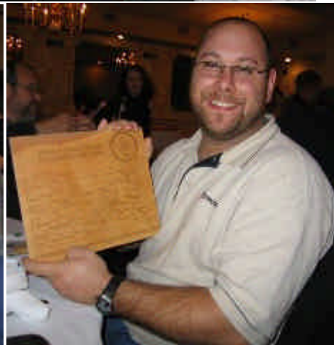
Some of our "Chinese Auction" winners