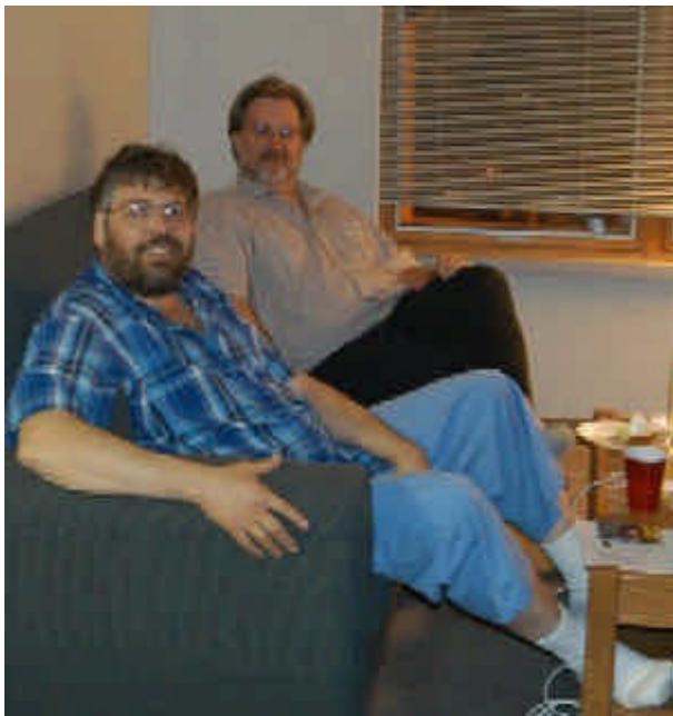
(Meeting Minutes Continued from page 4)