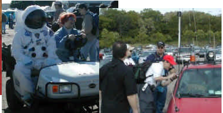
Below left: SuitSatMan? Stranger than YagiAntennaTowerHardHat Guy? Below Right: Some of the gang examining the Porcupine Mobile!