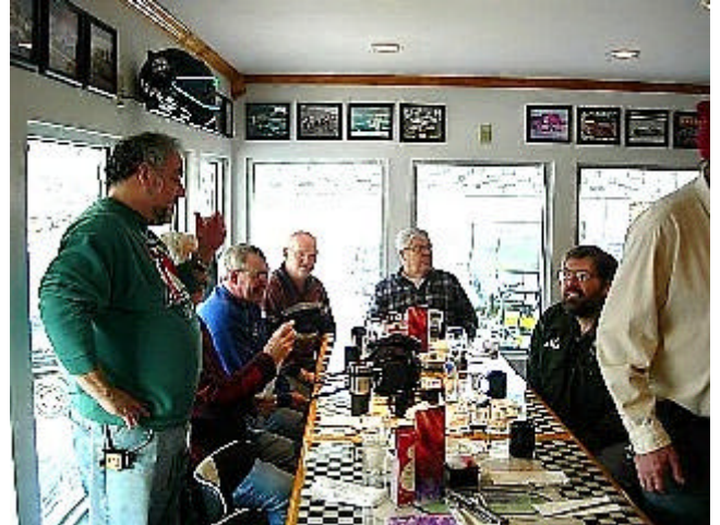
Some of the January Breakfast Gang. (L—R) WN3VAW, N3HKQ, N3IDH, WB4GCS, W9UUK, N3ZNI, N3XFE