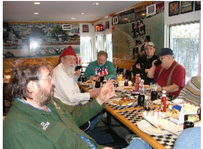
Some of the January Breakfast Gang. (L—R) N3ZNI, N3XFE, WN3VAW, W8LEV, W3WH.