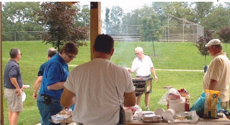
2003 Picnic photo courtesy of & ©Copyright 2003 Jacqué Gosselin N3ZEL

Keep an eye on the club reflector for the latest developments and information, and how you can help out with this event!