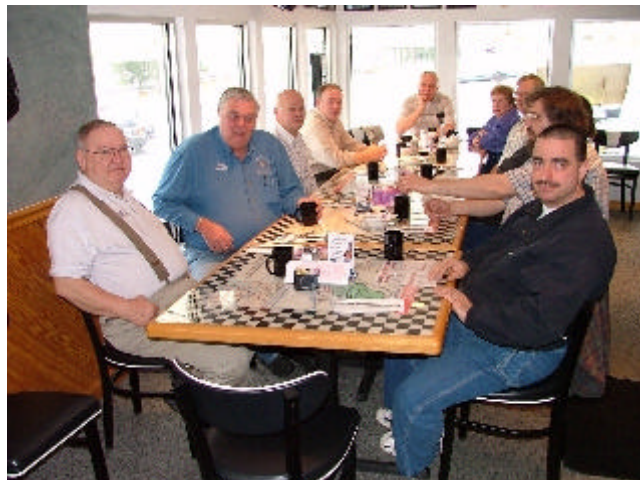
The WASH Breakfast Gang at the March Breakfast.