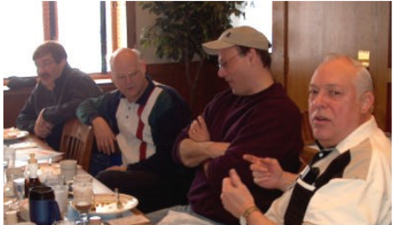
W3RJM, WB4GCS, W8LEV and KB3FNM having a great time talking (the food's getting cold guys!) during the January Club Breakfast.