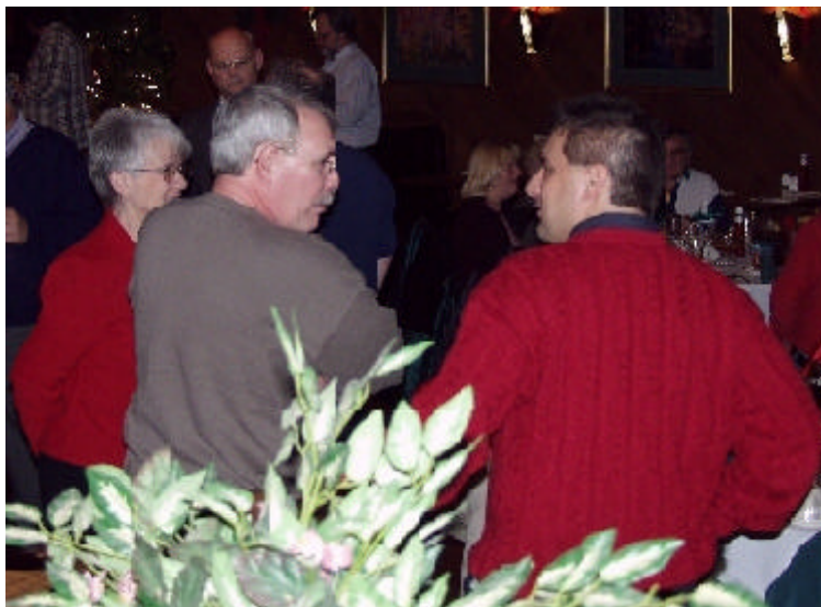
From the 2003 Christmas/Holiday Party: Photo courtesy of & © 2004 Dan McCann KB3HVN