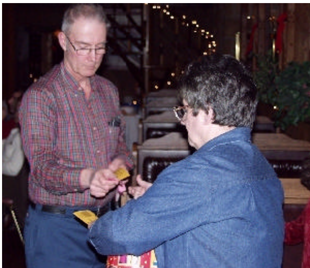
From the 2003 Christmas/Holiday Party: Photo courtesy of & © 2004 Dan McCann KB3HVN

Whether you agree with the basic premise or not, describing the same antenna by several different and misleading names is confusing for all. Let's all endeavor to keep the aforementioned in perspective and skip the misleading nomenclature, which is all too prevalent in our hobby.