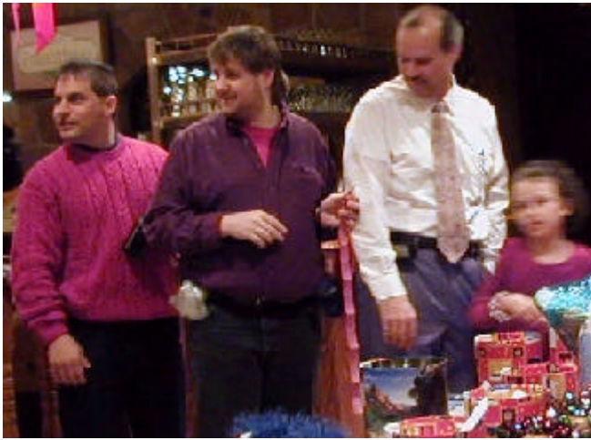
From the 2003 Christmas/Holiday Party: Photo courtesy of & © 2004 Tippi Comden WA3JPP