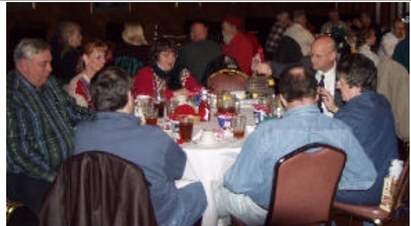
From the 2003 Christmas/Holiday Party: Photo courtesy of & © 2004 Dan McCann KB3HVN

— information courtesy of Eric Heard KU4TF and Mike Potaczala KC4NUS