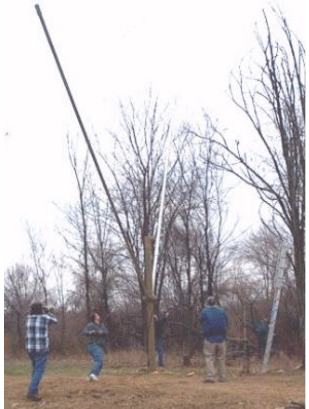
Raising one of the masts for one of the "4 Square" antennas on March 18 th