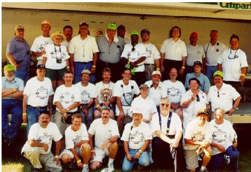
camera at the end of the day.