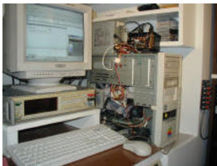
The I-Link Interface at N3UE's shack

Just listen for a station calling CQ and answer like you would any (I-Link Continued on page 8)