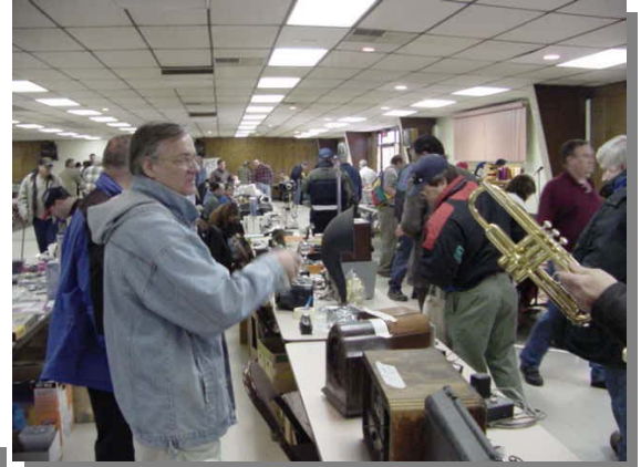
The record turnout was music to our ears!