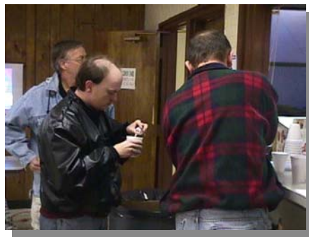
Coffee, anyone? Free coffee courtesy HRIA, Photo courtesy of & ©2002 \ Bill Hill W3WH