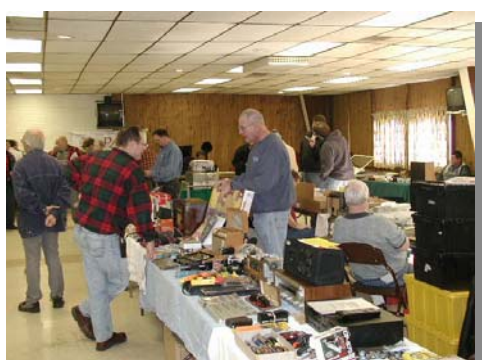
Shtuff, shtuff, and more shtuff!