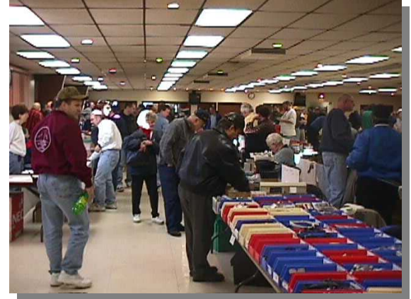
The hall filled up with amateurs from the entire tri-state area, starting right after the doors opened at 8 AM — and pretty much stayed that way until just before noon!

Our thanks to everyone who helped make WASHFest 2002 another huge success — the attendees, the vendors, Jack from Hoagie Haven, and last but not least, all of the WASH members who came and helped, who stuffed flyers, and who talked it up on the air!