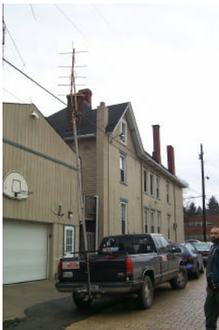
N3UML has to watch out for low bridges with this impressive mobile setup!