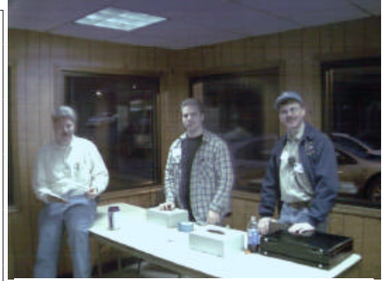
The first thing the vendors see in the morning: N2QIV, KB3ERQ, W3SRL