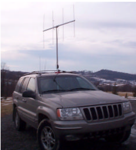
I used a 4 element, beam (Arrow brand) on a 6 foot mast, through the sunroof. Retracted slightly as I traveled to my three locations: Bridgeville, Scott Twp, and Mt. Lebanon. Power out: 10 watts. — KE3XB