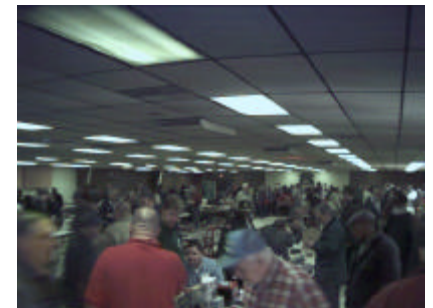
WASHFest 2001 in Full Swing!

WASH wishes to thank our friends in the Pittsburgh Antique Radio Society who helped make the arrangements for the class room.