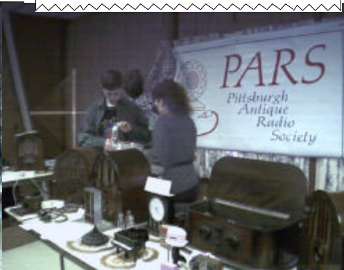
The Pittsburgh Antique Radio Society members setting up their very impressive display!