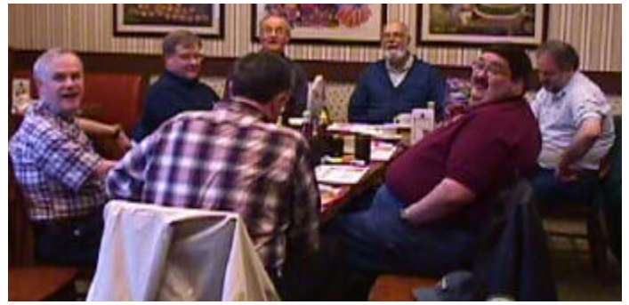
Would you want to be seen in public with these guys? WASH Club "Breakfast-eers" at the King's Family Restaurant on McMurray Road — Clockwise from left: N3RNX, KB3CPI, K3VX, KB3ENX, WN3VAW, W3RJM, KB3EPC's back. (Not shown: W4ZE & W3WH)