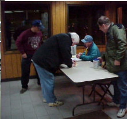
Vendor Check In, about 6:30 AM