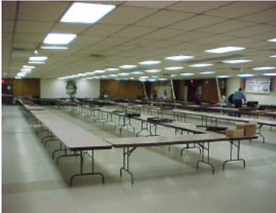
View of the hall, about 5:30 AM