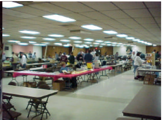
About to open the floodgates, 7:55 AM