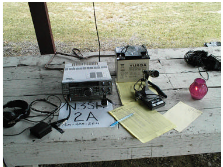
HF Station Two (80, 75, 40, 20)

Congratulations to our friends in WACOM for working into Cuba on 6 meters from WA3COM during FD! "I heard Steve on 20 meters talking to another station but I couldn't raise either one" — NP2JF /1A Battery