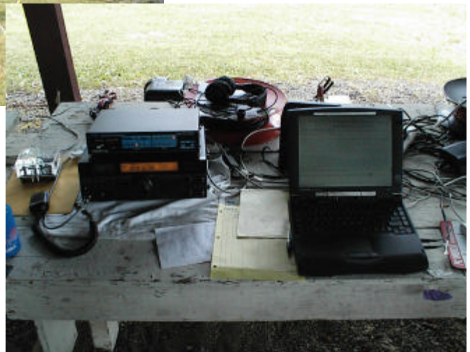
HF Station One (160, 20, 15, 10) running PSK31

I don't think I have ever had such a good laugh! I guess in NAQP when I use Sluggo as my name that is also a false signal since everyone knows I'm just plain Mike! Yes.. I do plan to frame both of these fantastic cards!" — Mike K5NZ