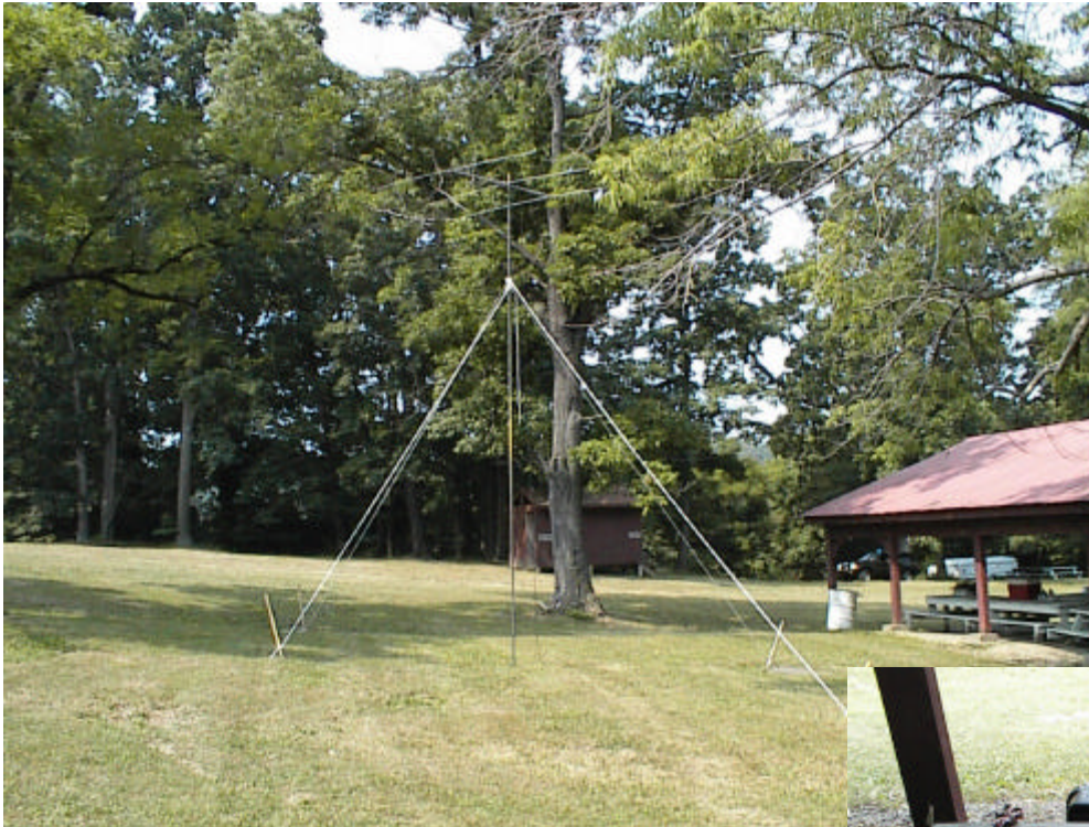
Three Elements, 6 Meters, No Waiting! (Also a nice view of our pavilion!)