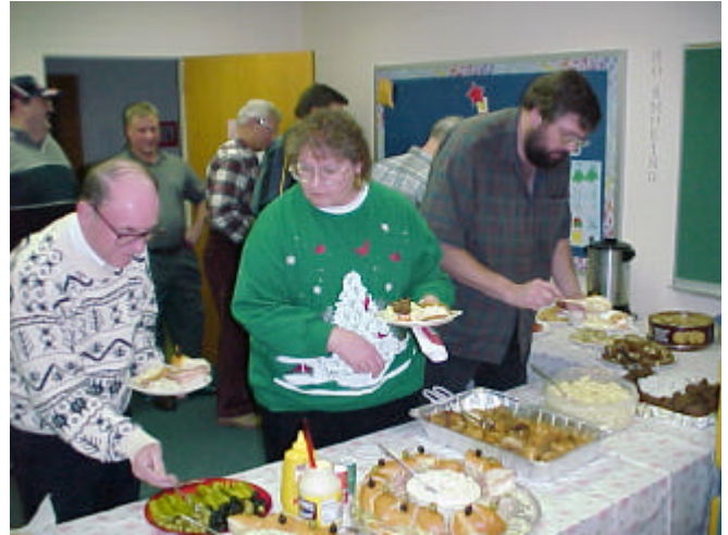
You didn't really think good food lasts long, does it?