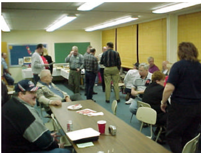
What do you mean, who's ready for the next course?