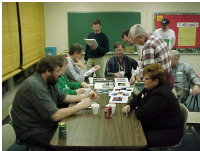
Judging the Shack Photo Contest... decisions, decisions...