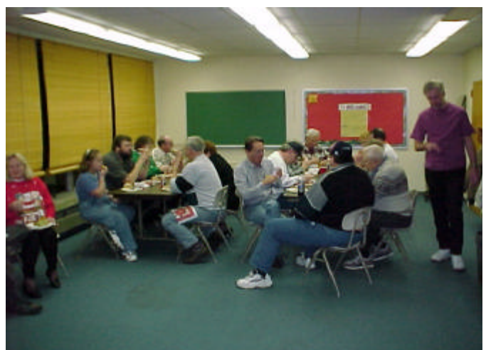
Meeting? Wait a moment, First things first!